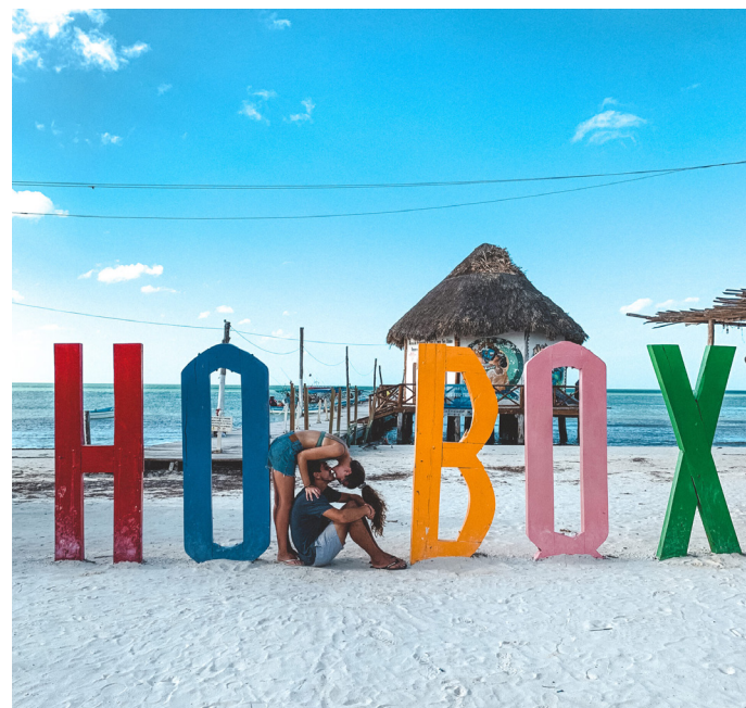
Holbox, Quintana Roo, Mexico

Its climate is tropical most of the year and hot in summer and it usually has sporadic rains from June to May. Most of the island is considered as a protected nature reserve.