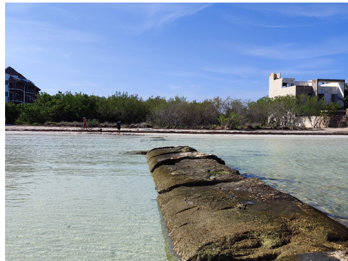
Site located on the coast of Holbox Island, Mexico