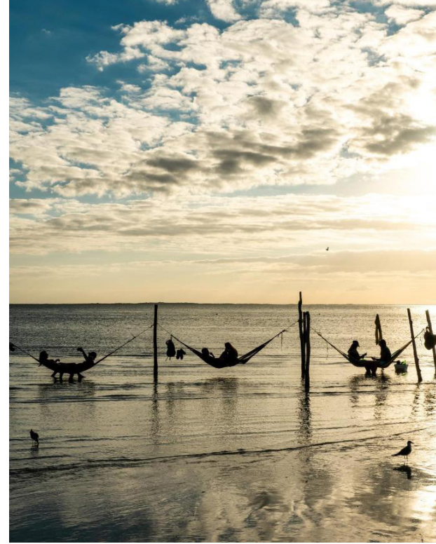
Travelers resting on the beach of Holbox, Mexico.