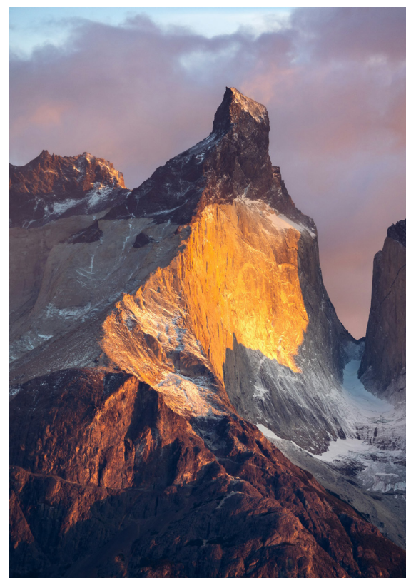
Mount Fitz Roy, Los Glaciales National Park.

In the mountains, pausing is not only a physical necessity, but also a perceptual experience. It is in these moments that the landscape ceases to be a backdrop and becomes the protagonist. This competition proposes reflecting on the possibility of introducing a mountain sanctuary that functions as a rest stop, conceived not as an isolated object, but as part of the journey itself.