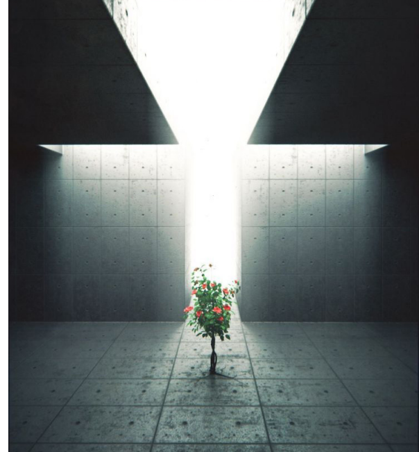
Sanctuary: Pause, silence and observation.

The sanctuary should establish a careful relationship with the landscape of Mount Fitz Roy, avoiding excessive prominence and prioritizing framing, paths, and sensory experiences.