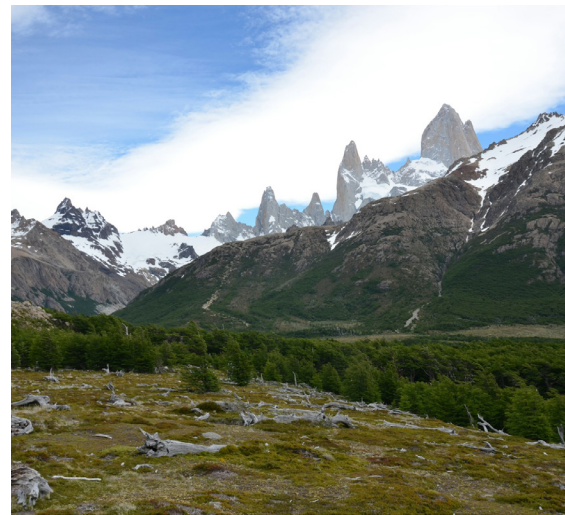
Natural plateau located above the path leading to the Laguna de los Tres.